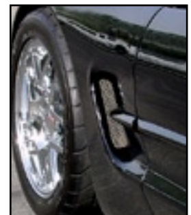
C5 Finished Screen