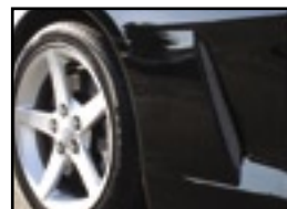
C6 Finished Screen