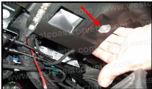
Pull wires all the way through. Reach up and unlock the factory light by turning it clockwise. Drop it down to wire the leds.