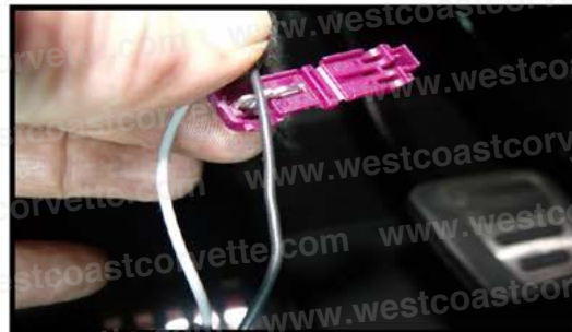
Place one wire in each supplied connector and fold closed. Gently close with pliers until it latches. Repeat with other wire.