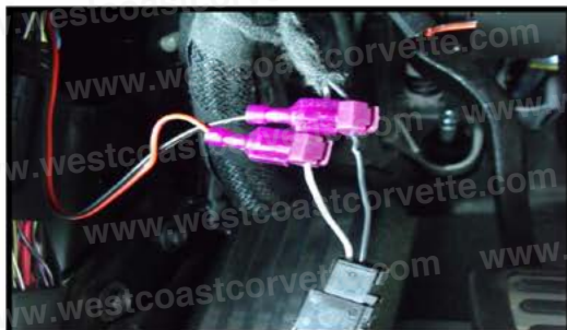
There is a slot in the back of the connectors. Before you plug them in be sure the wires go above the hood release cables and wiring harness. Connect the red wire to Tan and Black to Black. Make sure lights are now working and be sure lights haven't timed out. You can now re install the light in the shield above the drivers feet. Now move to the passenger side.