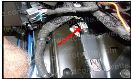
Behind the panel you just removed look for this wiring harness. Grab it and follow it up to where it meets the inside of the car. With your finger, push down on the top to release the cover which will pop out between the door and the car where you routed the wires.