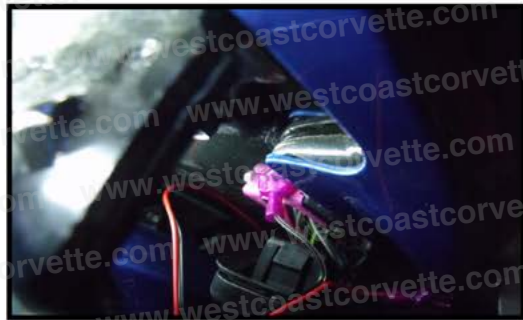
This is the part that requires a little patience. Its hard to see exactly but you can pass the connectors through on top of the purple block as long as they are done one at a time and the connectors need to be horizontal to fit. You can reach up from inside to grab it once it comes through. Once one is through, gently pull the other one through making sure it is horizontal.