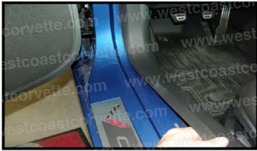
The bottom sill panel pulls straight up.